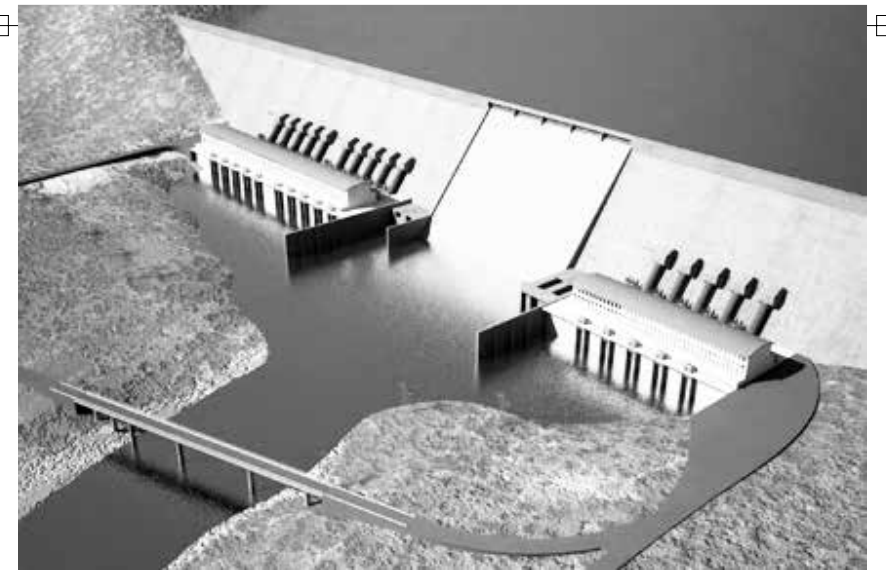
Conversion of Egyptians

Today 90% of Egyptians are Muslims. Not all Egyptians are fundamentalists and recent demonstrations indicate a large percentage are nominal Muslims opposed to the Muslim Brotherhood, However, after the Rapture we read that 144,000 Jewish men will be sealed by God to preach the Gospel of the Kingdom "in all the world" (Matt.24:14). It is therefore clear that these servants of God will bear testimony in Egypt and through their testimony many Egyptians will seek the Lord so that Isaiah states: